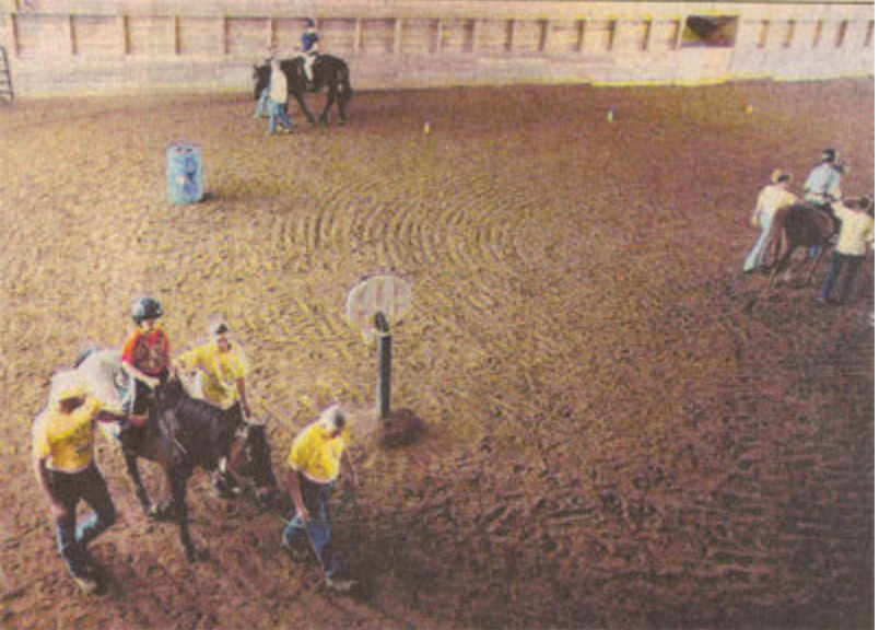
Riders and volunteers circle the ring at Therapeutic Riding Equestrian Center in Fairview Township on June 22. GREG WOHLFORD